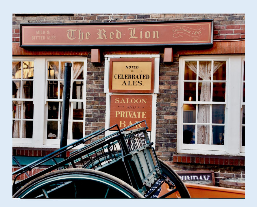
Can you identify the starring actor here?